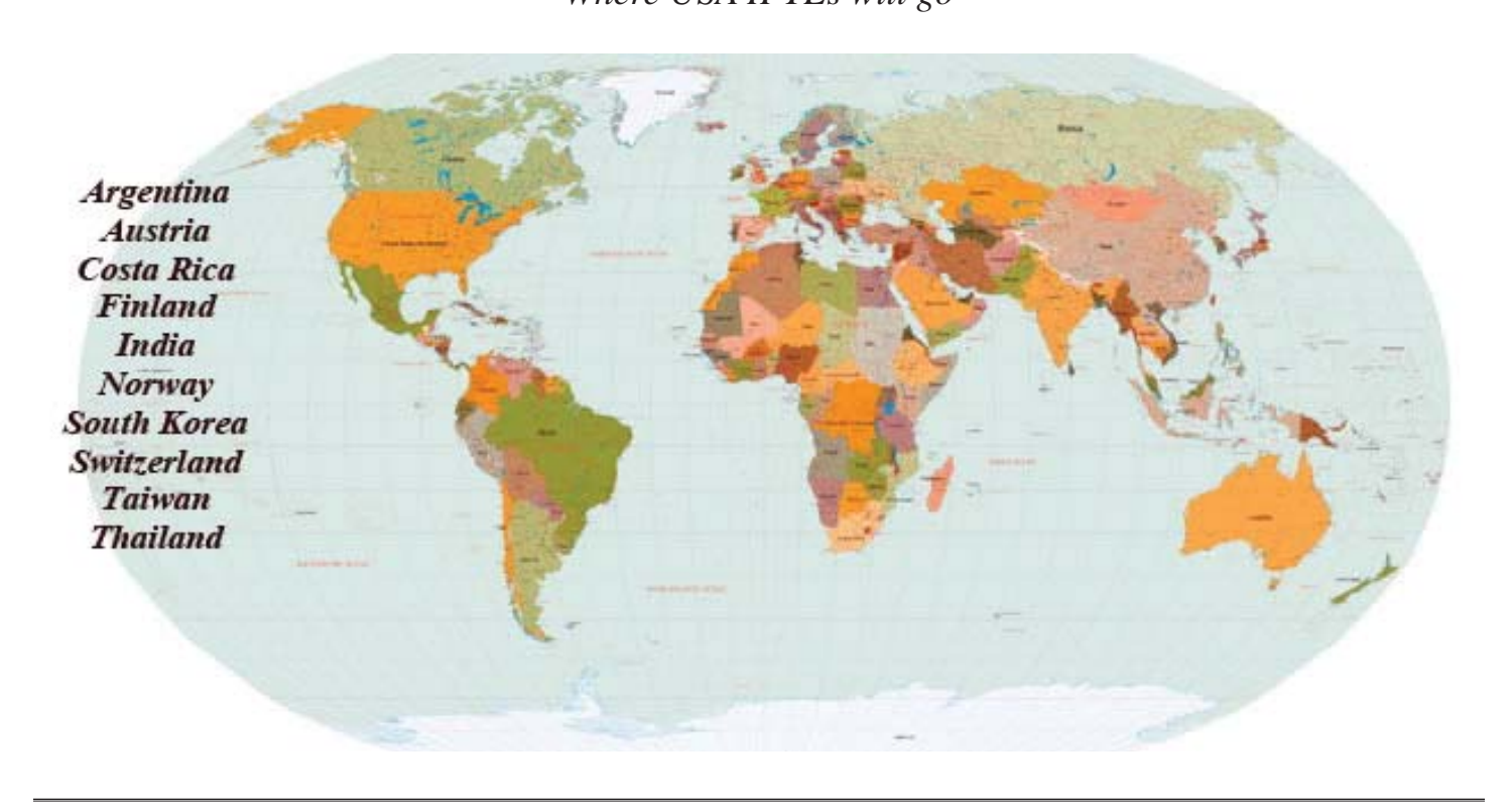
Our Sending Country Partners - 2018 Home Countries of IFYEs coming to the USA