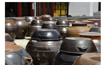
Kimchi pots - 40 lbs. of kimchi (spicy and fermented seasoned cabbage of which there are more than 250 kinds) is consumed annually by the average Korean.

Agriculture in Korea is diverse; however, much is still imported such as fruit from China and beef from the United States. Agriculture in Korea is still a