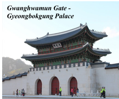
Gwanghwamun Gate - Gyeongbokgung Palace