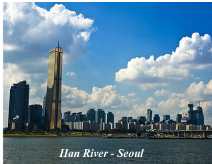
Han River - Seoul