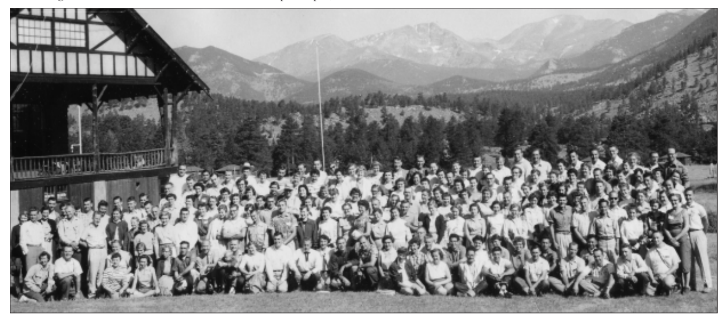
50 Years Ago - August 7-10, 1956 - National IFYE Conference - Estes Park, Colorado

Register today. You are encouraged to photocopy the registration form on page 6.....or this page to save the program information.