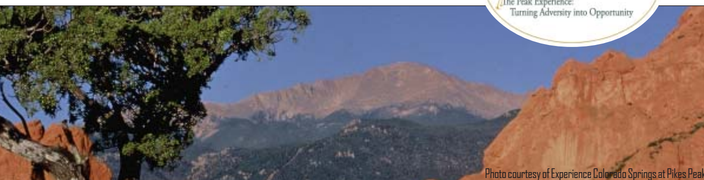
National IFYE Conference - August 23-27, 2006 - Colorado Springs, Colorado