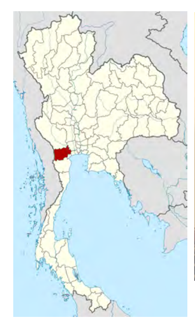
Ratchaburi Province, Thailand - Area of Beau's first host family and his helping to build a bamboo chicken house. (See story on page 4.)