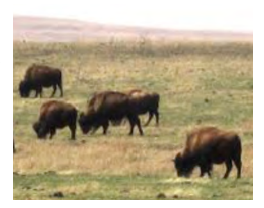
Bison grazing on the Tallgrass Prairie Preserve.

Visit the Goodnow House and the Riley County Historical Museum to learn about the history of Kansas State and Manhattan. Visit Justin Hall to learn about Kansas State Programs in Human Ecology and tour Bill Snyder Stadium on the K-State campus. Visit the Kansas Wheat Commission and the Grains and Feed Technology Center.