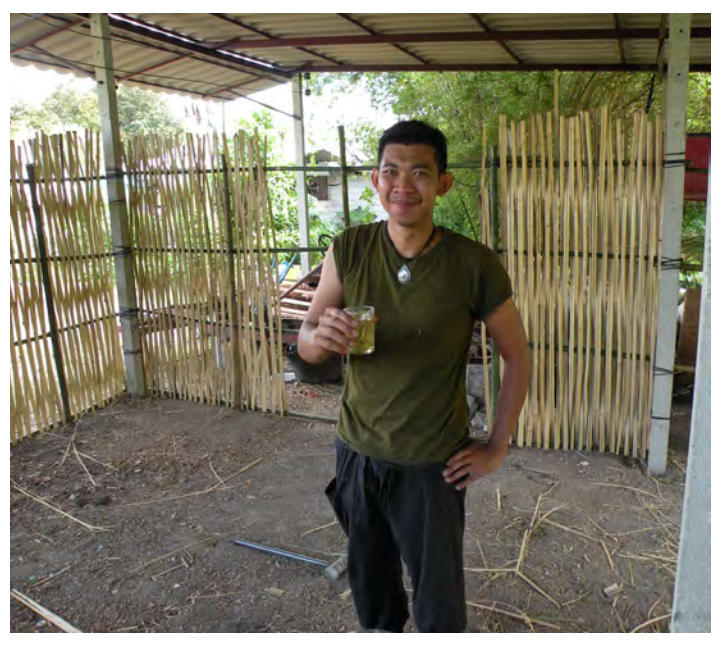
"Pot" taking a break as we get close to finishing the chicken house

After many cuts and close calls with the knife, we were nearly done! I don't think I have been more proud of building anything in my life.