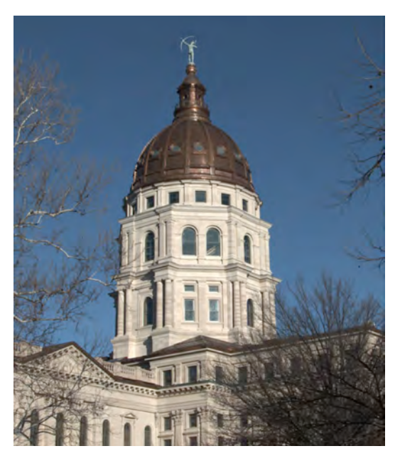
Kansas State Capitol

Lunch will be at the Friendship House in Wamego, followed by a tour of the Wizard of Oz Museum and the Columbian Theater, decorated with murals from the 1904 Chicago World's Fair. Stop on the way back at the KSU Dairy Bar for ice cream.